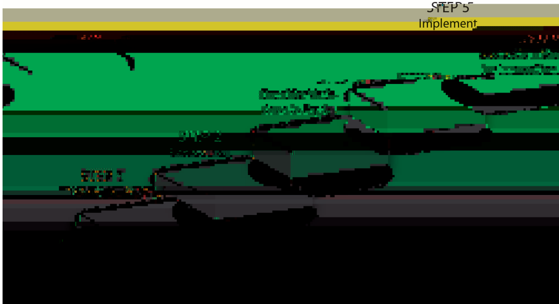
Figure 3: Step 1 of the Orientation and Onboarding System Toolkit

Go to Step 1 of the Orientation and Onboarding System Toolkit: Take the Audit.