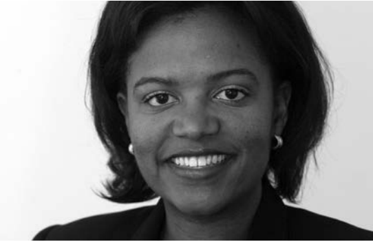
Senator Linda Dorcena Forry

In April 2013, Linda Dorcena Forry was elected to the Massachusetts State Senate. Senator Forry, a native Bostonian, is the first woman and person of color to represent the Commonwealth's 1st Suffolk District, a diverse and thriving cross-section of Boston that includes Dorchester, Hy5F.4(i)0.5(o74.